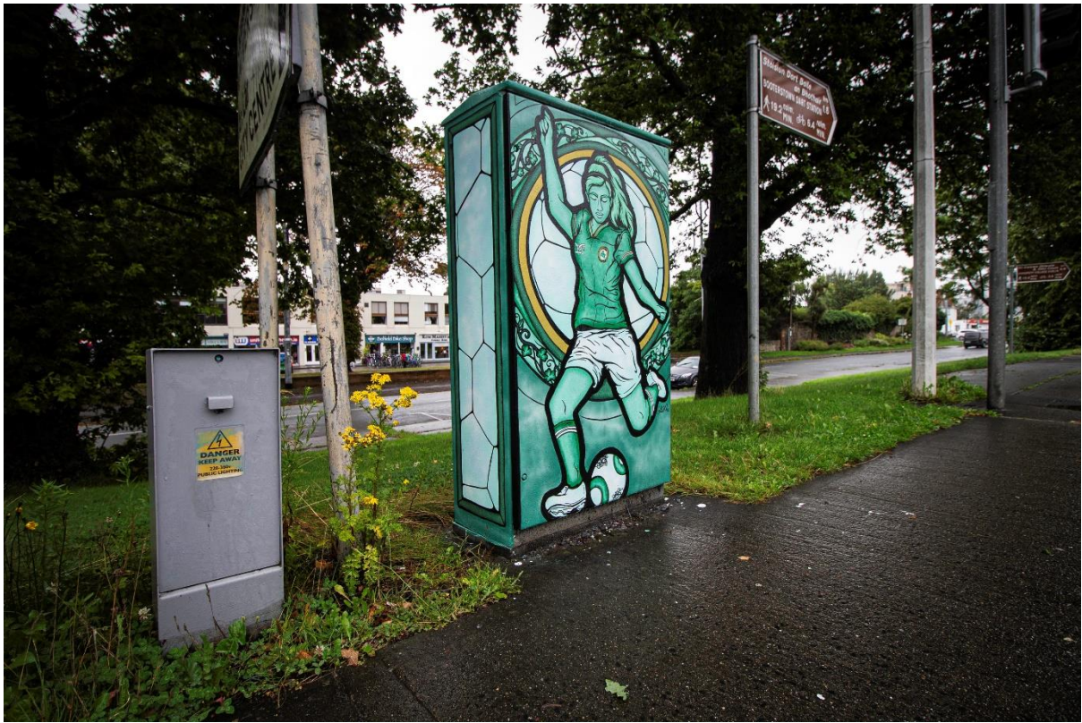
'World Cup' by Shauna Heron. Stillorgan Road Montrose, Dublin.