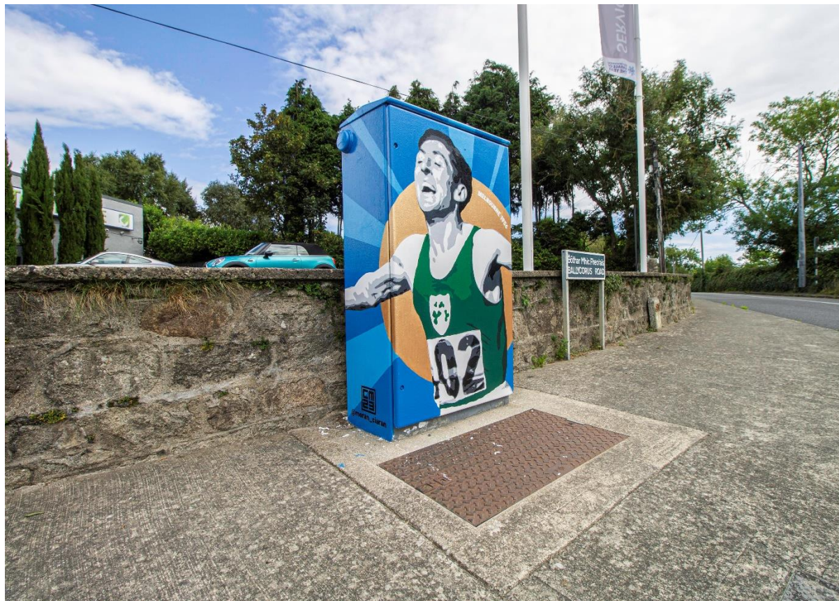
'Local Hero' by Ciaran Moran. Enniskerry Road/Ballycorus Road, Glenamuck South, Dublin 18.

The project takes previously unused public space and transforms it into canvases to help brighten up each area. Making Dublin a more beautiful place to live, work and visit.